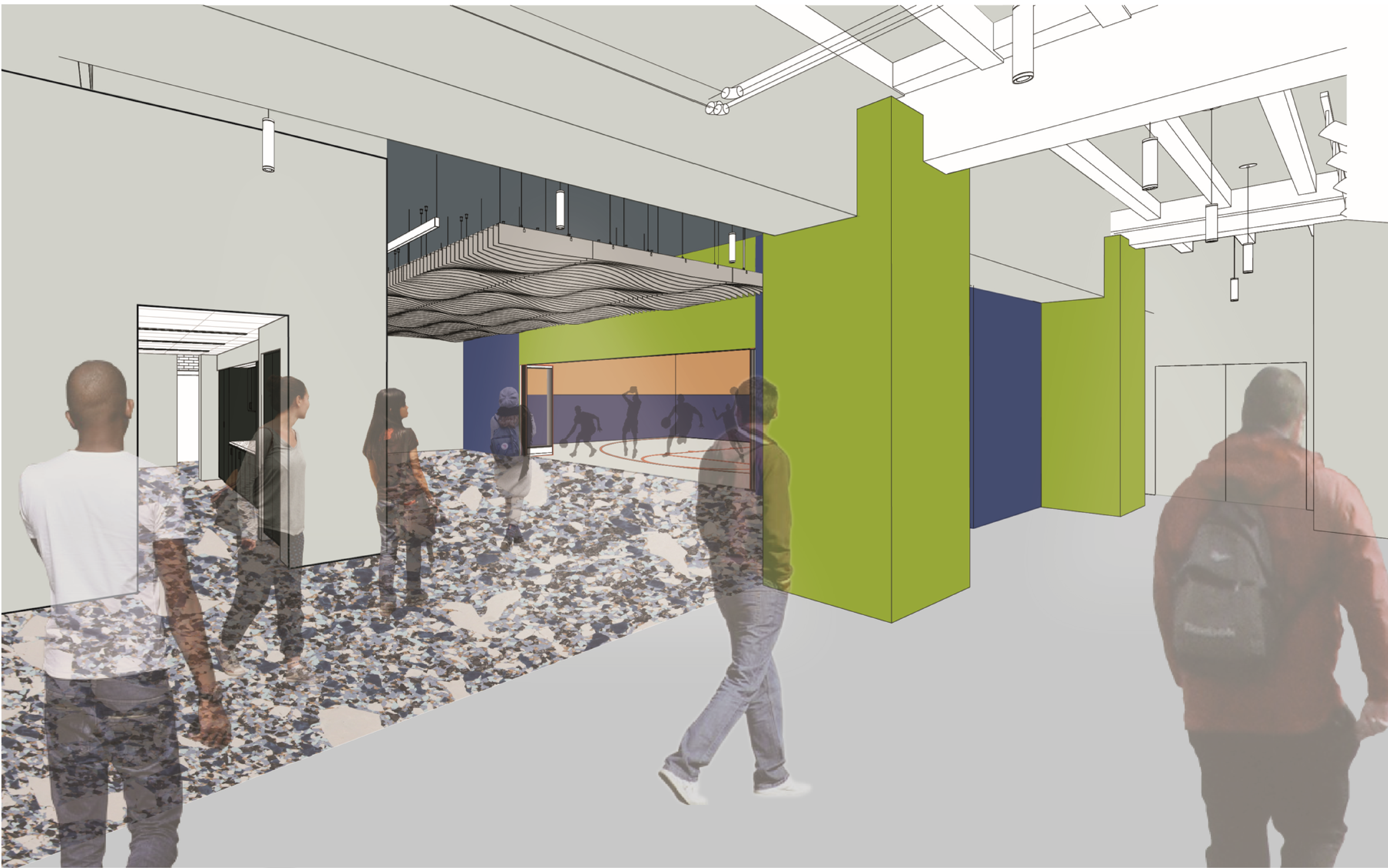
VIEW TO TOWN HALL / GYM