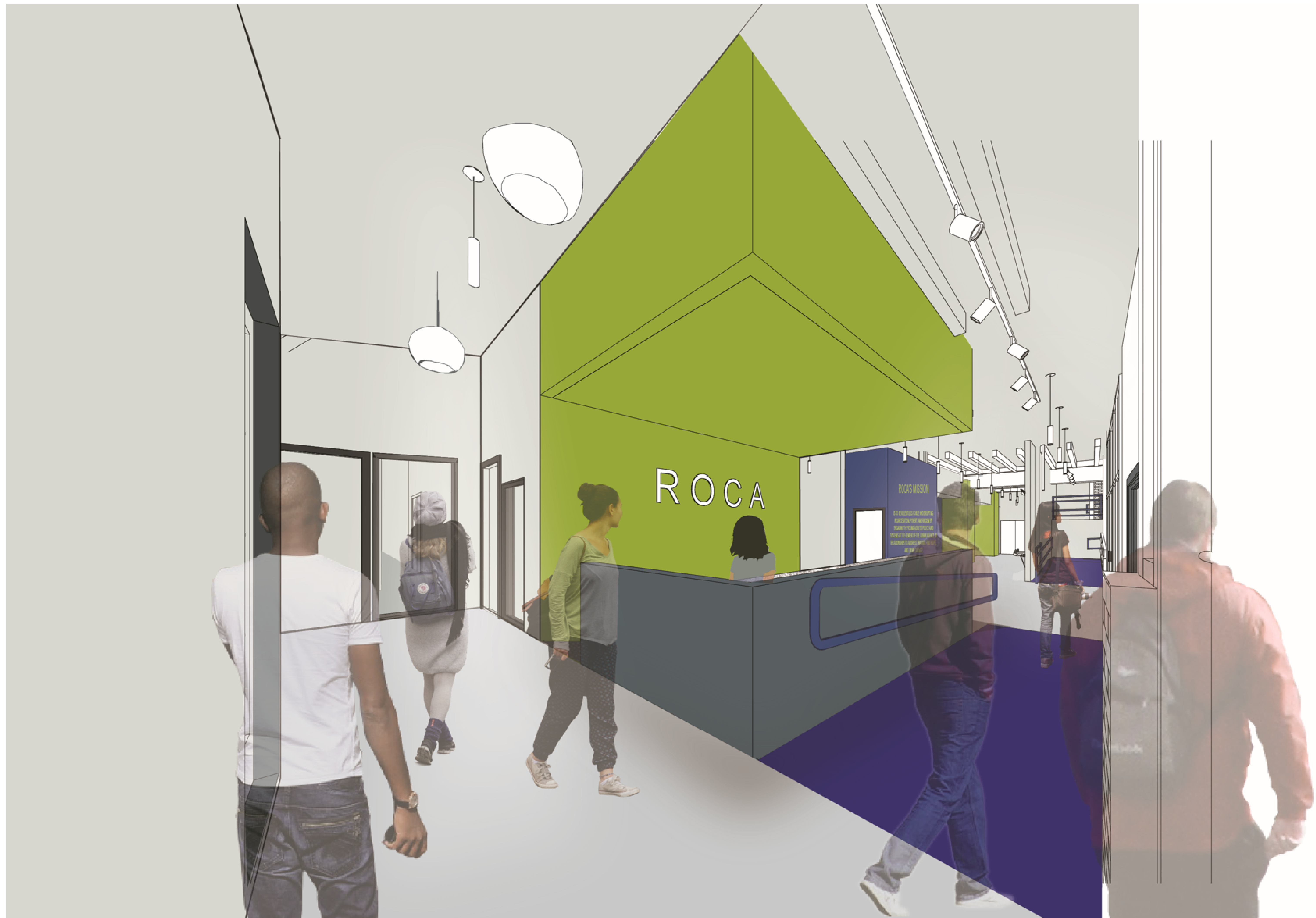
VIEW TO ENTRY RECEPTION